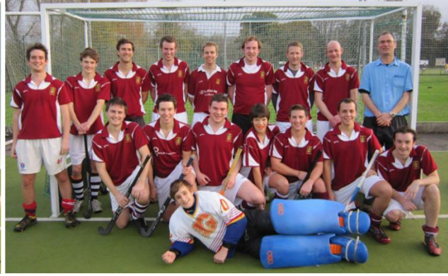
GHC Men's Shadows XI - 2011/2012 - The most successful team in the club (second year running?)