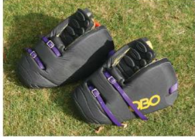
OBO Cloud 9 Kickers Medium