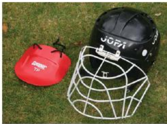
Jofa Ice hockey helmet 390. Size 55-62