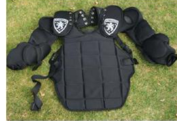
Gryphon chest and arm protector (no size)