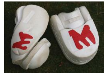
Monarch Gloves Medium

Sadly this kit hasn't been used for some years now, it has just been sitting in the garage. The obo gear was only used for one season, so is in great condition. I would like to sell the kit as a complete set but open to offers.