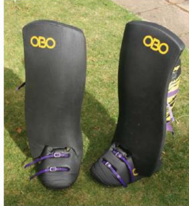
OBO Cloud 9 Legs Large