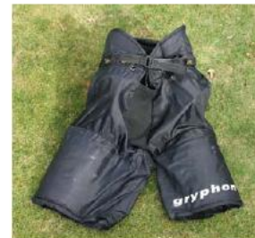
Gryphon Shorts (no size)