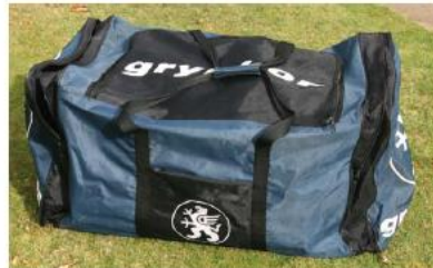
Gryphon Bag (pretty worn!)