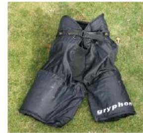
Gryphon Shorts (no size)