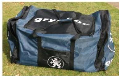
Gryphon Bag (pretty worn!)