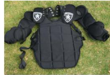
Gryphon chest and arm protector (no size)