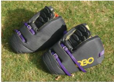
OBO Cloud 9 Kickers Medium