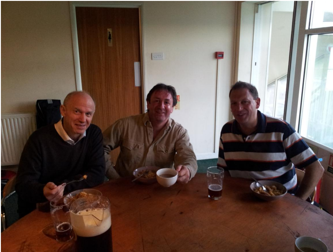
The triumphant goalscorers celebrating (after the game?)

after a well timed run” . The three goals scorers at the press conference feature on our Page 3 special below.