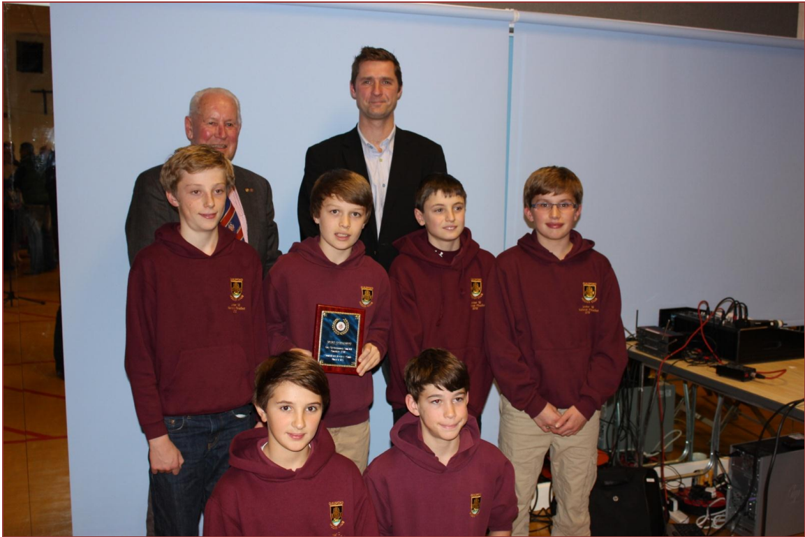
Even our Club President Had to get in on the act!!!