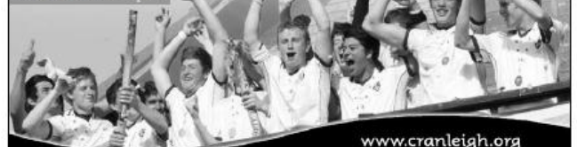
Cranleigh U18 Boys National Outdoor Champions

Please contact: The Head of School Administration, Cranleigh School, Horseshoe Lane, Cranleigh, Surrey GU6 8QQ Tel: 01483 273666 Email: msp@cranleigh.org