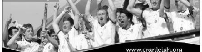
Cranleigh U18 Boys National Outdoor Champions

Please contact: The Head of School Administration, Cranleigh School, Horseshoe Lane, Cranleigh, Surrey GU6 8QQ Tel: 01483 273666 Email: msp@cranleigh.org