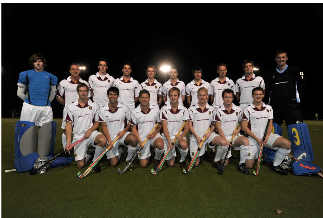
Guildford Mens 1 st team squad