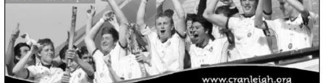
Cranleigh U18 Boys National Outdoor Champions

Please contact: The Head of School Administration, Cranleigh School, Horseshoe Lane, Cranleigh, Surrey GU6 8QQ Tel: 01483 273666 Email: msp@cranleigh.org