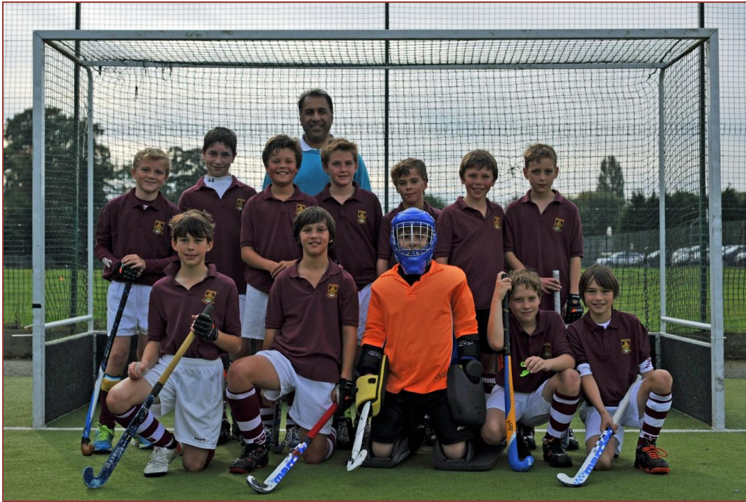
The team with Kulbir Bhaura, Men's Field Hockey Gold Medalist, 1988 Seoul Olympics