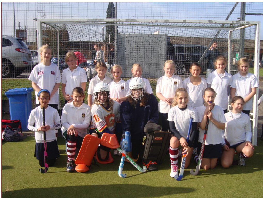
Below: The 2 Guildford Teams

Well done to all the girls who took part, parents who supported and helped, and umpires for their work.